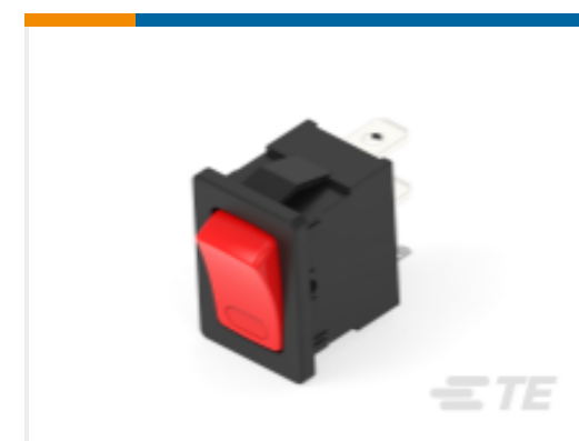
TE Part # 1571083-2 PRASC1-16F-BBR00=POWER ROCKER