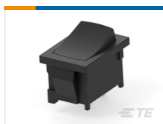
TE Part # 1-1571076-2 PRASA1-16L-BB000=POWER ROCKER