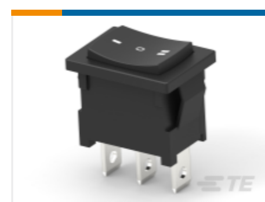
TE Part # 1-1571079-4 PRASD4-16F-BB0FW=POWER ROCKER