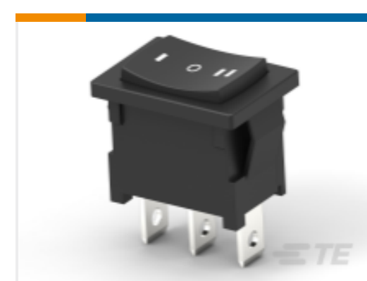
TE Part # 1571079-9 PRASD3-16F-BB0GW=POWER ROCKER