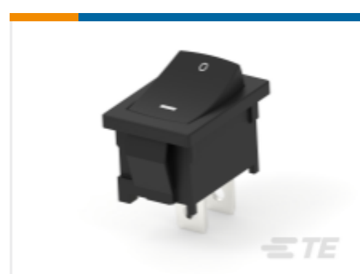
TE Part # 1-1571076-1 PRASA1-16F-BB0CW=POWER ROCKER