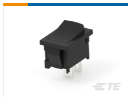
TE Part # 1571076-9 PRASA1-16F-BB000=POWER ROCKER