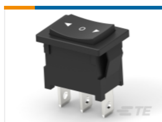
TE Part # 1-1571079-6 PRASD5-16F-BB0KW=POWER ROCKER