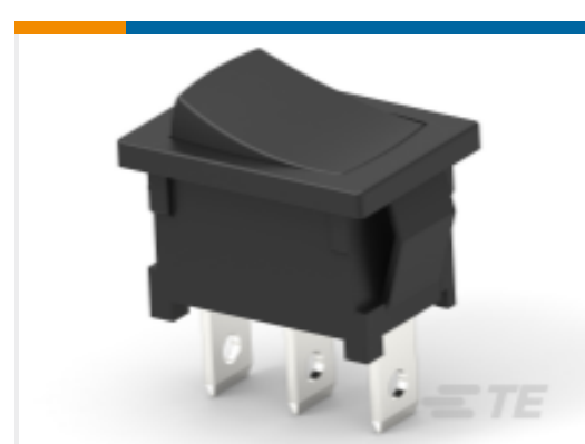
TE Part # 1571079-4 PRASD1-16F-BB000=POWER ROCKER