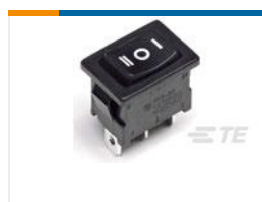
TE Part # 1571078-4 PRASB2-16F-BBR00=POWER ROCKER