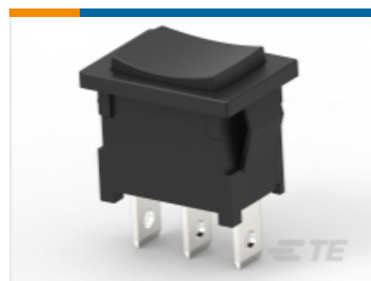
TE Part # 1571079-7 PRASD3-16F-BB000=POWER ROCKER