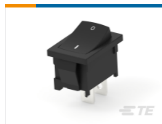
TE Part # 1-1571076-0 PRASA1-16F-BB0BW=POWER ROCKER